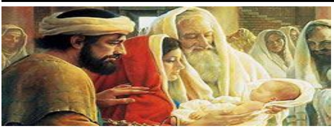
Simeon took the child into his arms and praised God