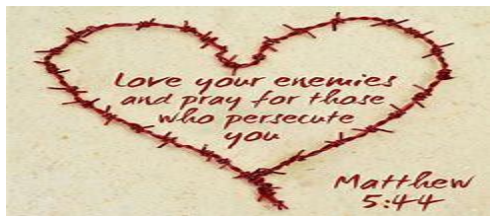
Matthew 5:44 Love your enemies and pray for those who persecute you