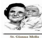
St. Gianna Molla

The Women's Retreat on Saturday April 4 th . Carol Mullins will lead a day of reflection Please pre-register if possible. Reservations call SEAS Parish office (366-1750) to place your name on the list. The $5 fee will be collected at sign-in. sign-in at 8:30 a.m. along with Breakfast foods Donuts, sweet rolls coffee, juice, water. Retreat sign-in at 8:30 a.m. along with Breakfast foods Donuts, sweet rolls coffee, juice, water. Retreat talks will be held at 9 a.m. and at noon, followed by a luncheon.