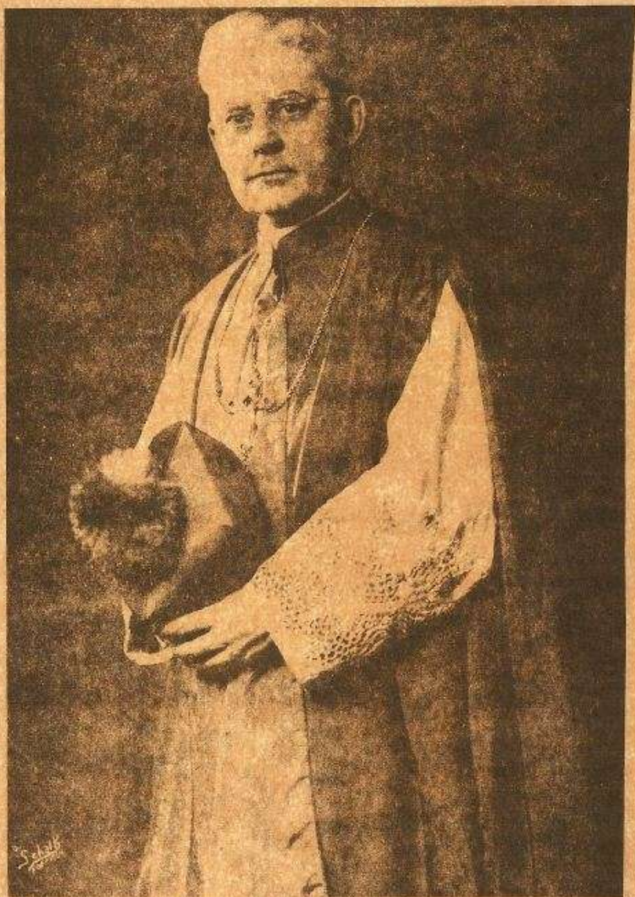
THE MOST REVEREND JOSEPH ALOYSIUS BURKE, D.D. Bishop of Buffalo