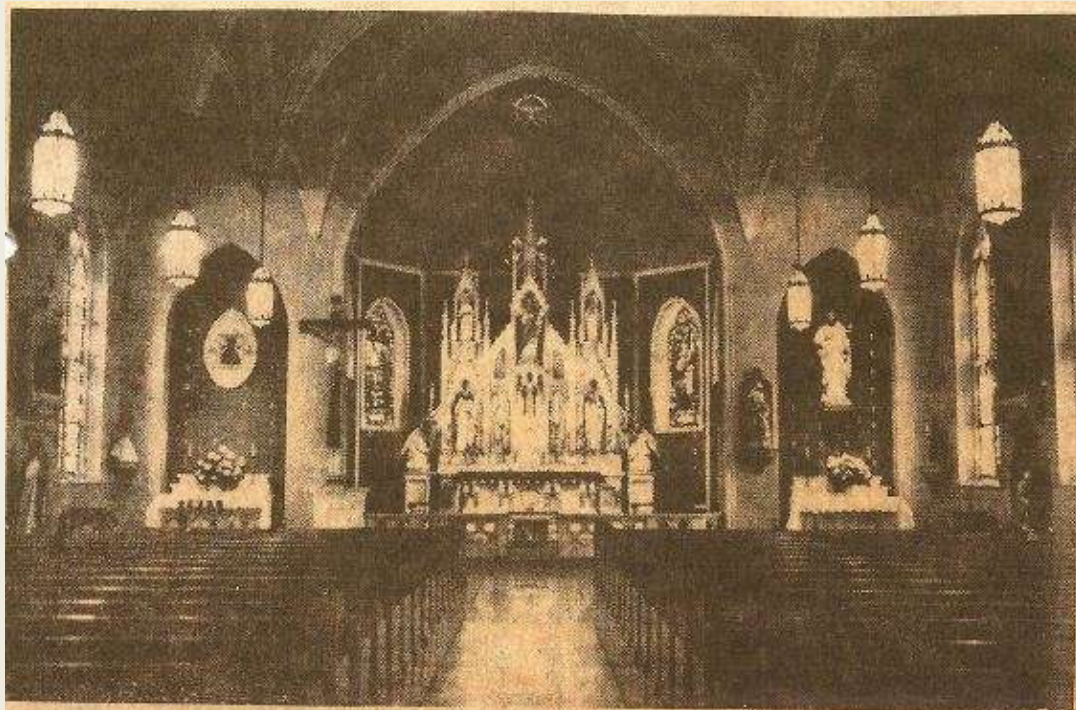
INTERIOR OF SACRED HEART CHURCH